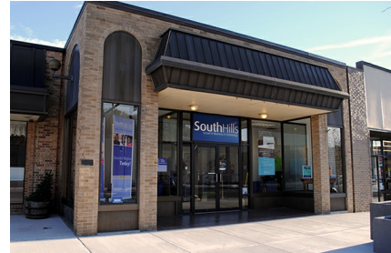
Lewistown Campus Spring Open House