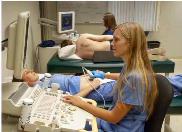
South Hills Third-year DMS Students practice their scanning skills in preparation for the first day of clinical internship

December is a busy time for the third-year Diagnostic Medical Sonography (DMS) students as they prepare to begin their clinical internships in January.