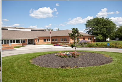
State College Campus Spring Open House