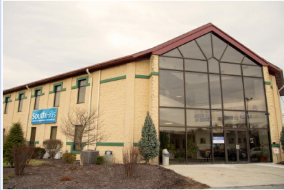
Altoona Campus Spring Open House