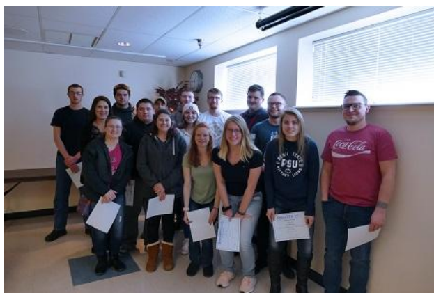
State College Campus C.O.P.S Club