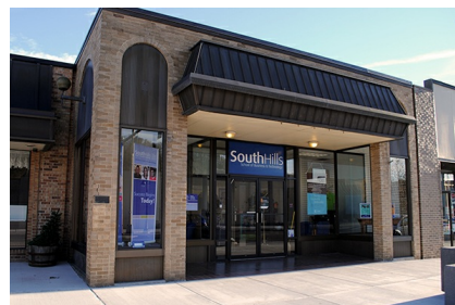
Lewistown Campus Spring Open House