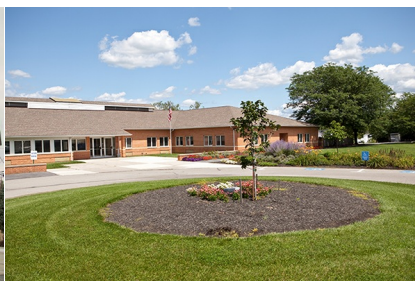
State College Campus Spring Open House