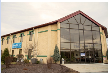
Altoona Campus Spring Open House