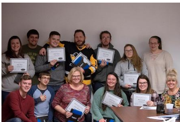
Lewistown Campus Student Ambassadors

Community service is a huge part of student life at South Hills, especially for the members of our clubs and service organizations. Each campus hosts an annual Student Appreciation Luncheon as a way to say thank you to the members for the volunteer hours they've put in throughout the school year. The students are treated to lunch, and presented with certificates of recognition. To find out more about the student clubs offered at South Hills visit www.southhills.edu/clubs .