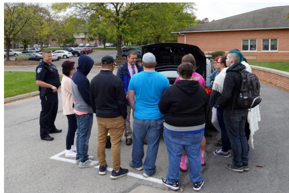
Students got to see some of the special equipment provided to SCPD law enforcement officers.