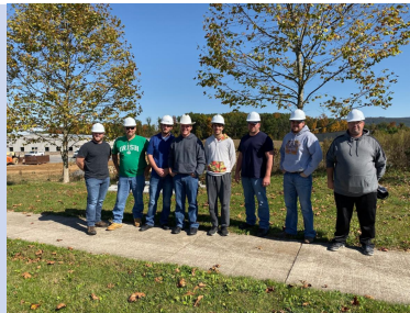
ET Architectural CAD students took a field trip to a construction site. They were able to see various parts associated with the civil discipline, i.e. site grading, survey stakes, rough parking lot layout, storm water methods. They were able to see how a pre-engineered metal building is put together and got a close-up view of exterior finishes, interior rough framing, plumbing, HVAC & electrical, drywall being installed, were able to review Code-approved building drawings.