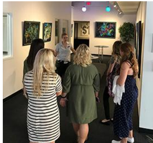
The tour included a discussion about 3 Dots' exciting event schedule and information about how they configure and transform the space for different needs.