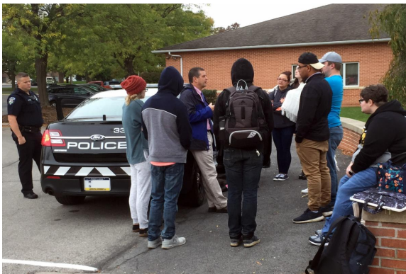
As part of "Introduction to Law Enforcement", first-year CJ students got a close-up view of a State College Police Department (SCPD) vehicle.